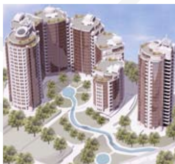
Vrubelevski Spusk, Kiev