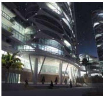
15 Moskovskaya, Yalta