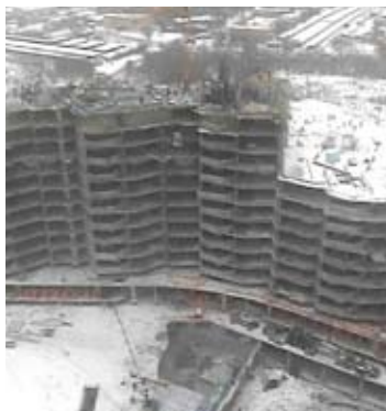
Diplomat residential complex