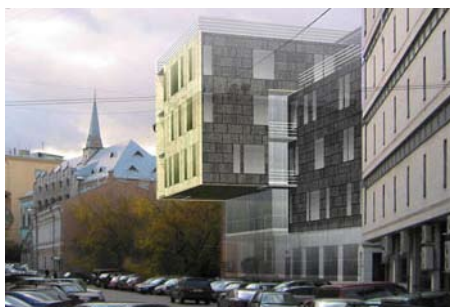
Class A office centre, 7 Nastasinsky, Blg 1