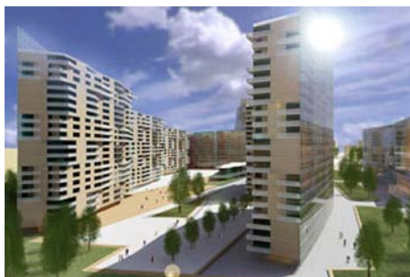
Preobrazhensky complex, 12/11 First Bukhvostova St.