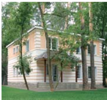
Serebryanny Bor single-family housing development (Phase III)