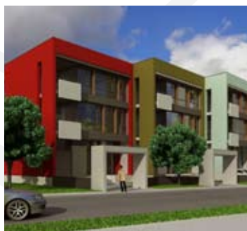
Zdravnitsa - Life Resort townhouse dev.