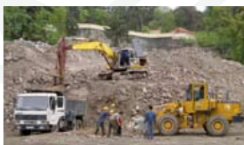
Kamelia resort complex, Sochi