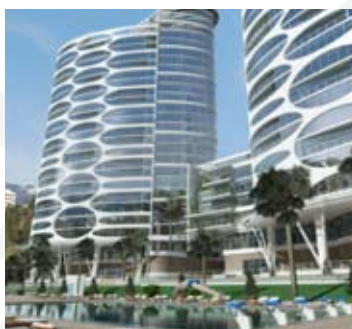
Elite apartments, Yalta