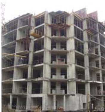
Emerald Valley Residential Complex