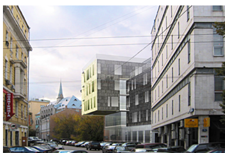
Class-A office centre, 7/1 Nastasinsky Lane