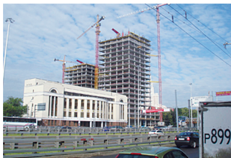
Leningradsky Towers, 39 Leningradsky Prospekt