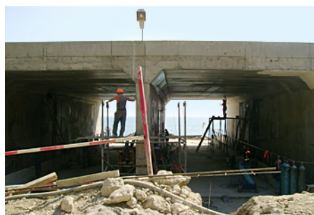
Kamelia resort complex, 89 Kurortny Prospekt, Sochi